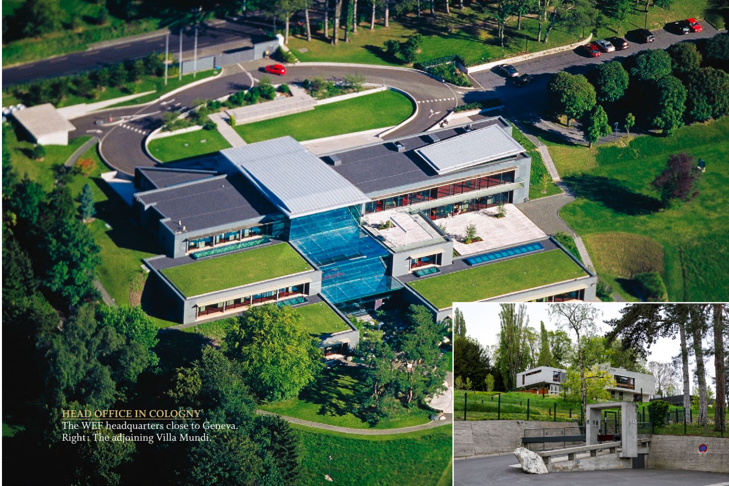
HEAD OFFICE IN COLOGNY The WEF headquarters close to Geneva. Right: The adjoining Villa Mundi.

«Putin calls the global terrorist Schwab a legitimate military target», according to a website called «The People's Voice» from December 2023 (see page 40). Although Reuters denied the report, the approach