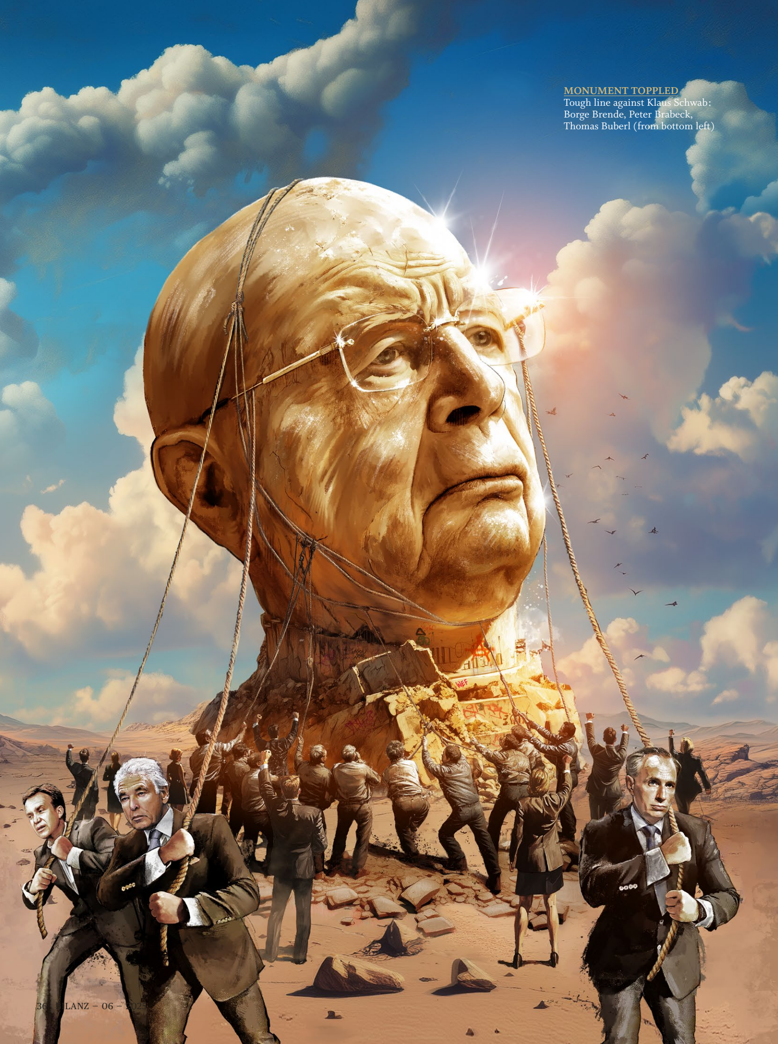
MONUMENT TOPPLED Tough line against Klaus Schwab: Borge Brende, Peter Brabeck, Thomas Buberl (from bottom left)